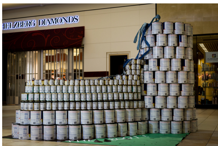
BEST THEME CAN Boot Camp: Give Hunger the Boot North Central Junior High

Visit CEDARRAPIDS.CONSTRUCTION.ORG to learn more about how you can be a part of Corridor Canstruction 2015!