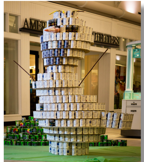
STRUCTURAL INGENUITY Do You Want to Build a SnowCAN? Heery and Tallgrass