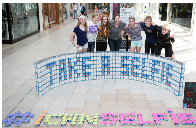
BEST USE OF LABELS #iCANSelfie Solon 8th Grade