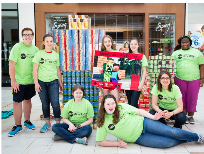
STRUCTURAL INGENUITY Minecraft CAN Biome South East Junior High, sponsored by Rohrbach Associates