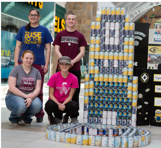
BEST IN SHOW We CAN Feed 'Minions' of People North Linn High School Honor Society