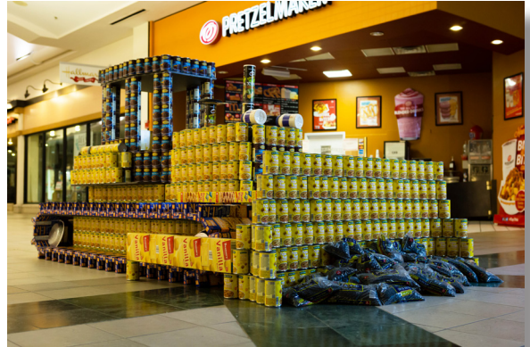
JUROR'S FAVORITE CAN-terpillar OPN Architects