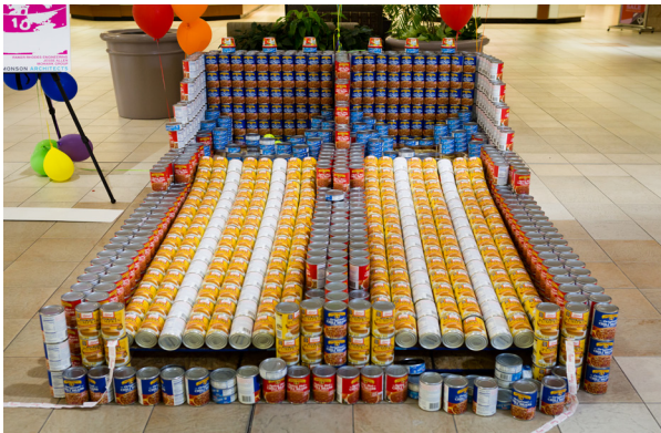
BEST USE OF LABELS Ballin' to Fight Hunger Neumann-Monson Architects