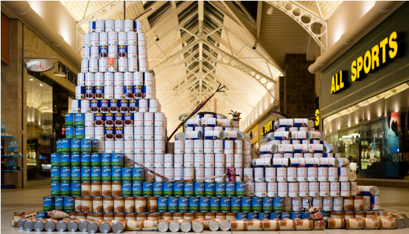
PEOPLE'S CHOICE AND BEST MEAL Dreams CAN Come True Shive-Hattery