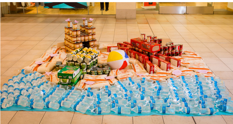
MOST LIFELIKE Wave Goodbye to Hunger Francis Marion Intermediate