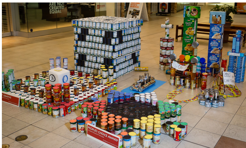
PEOPLE'S CHOICE AND MOST CREATIVE Hunger is No Game Prairie Elementary TAG