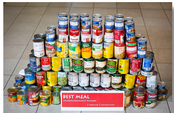
BEST MEAL CANbow Highland Middle School TAG

Visit CEDARRAPIDS.CANSTRUCTION.ORG to learn more about how you can be a part of Corridor Canstruction 2015!