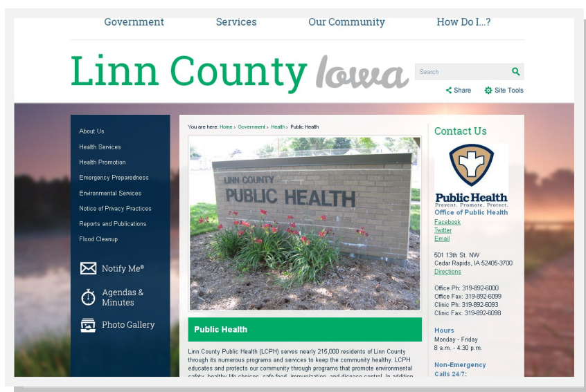
Screen shot of the Linn County Public Health website

In this issue, the five leading causes of death for residents of Linn County are presented. A comparison is provided between Linn County, Iowa, and the United States. The leading causes of death are then reviewed by presentation across the differing age groups within Linn County.